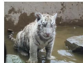
A white tiger cub: very cute!