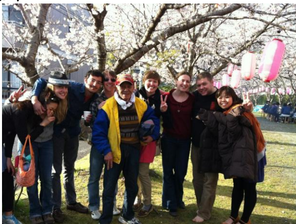
Me and my friends at the hanami at Nitta Shrine, Sendai

Hanami means 'cherry blossom-viewing party' in English. I went to two hanami parties in Sendai, and one in Kagoshima City. It was so much fun! I had a good time eating, drinking and talking with my friends. The sakura are very pretty, especially at night.