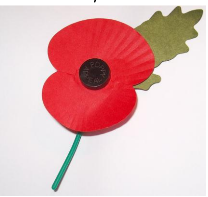
A Remembrance Day poppy badge. I will wear this badge every day in the week before Remembrance Day.