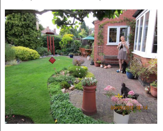
This is the beautiful garden at my family home