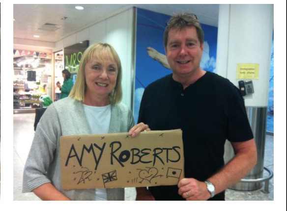
My parents @ They made this lovely welcome sign!