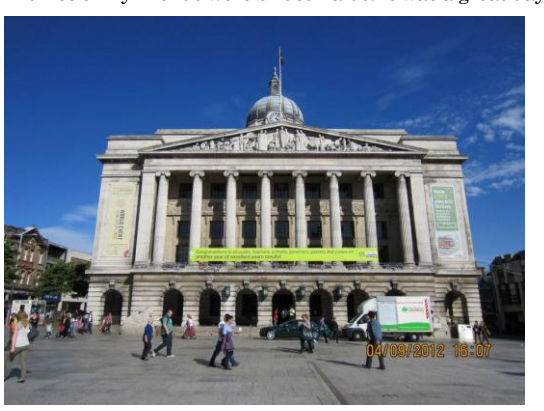
This is Nottingham City Hall. The weather was great!