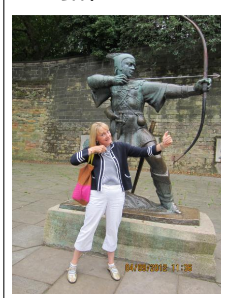
This is my Mother! She is in front of the

I had a great time! I went shopping, and I met many friends, I ate lots of delicious British food and I went to my best friend's wedding. I took around 200 photos! Here are some of my favourite photos from my trip.